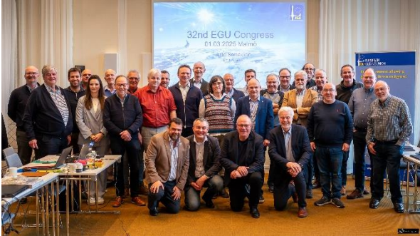
Delegates at the EGU Congress in Malmö

of EGU, it was possible to reduce annual fees as a onetime measure for Full Members by 30%. Our support to Ukraine continues also in this year with no fee for their membership.